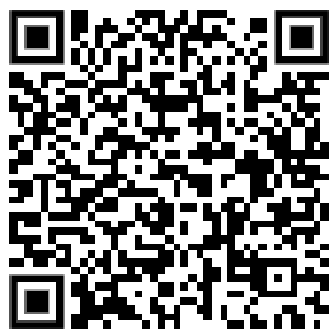
Figure 1: QR code link to MS pelvic health clinic questionnaire.

8 staff members were sent the questionnaire, this comprised the whole MS clinical department.